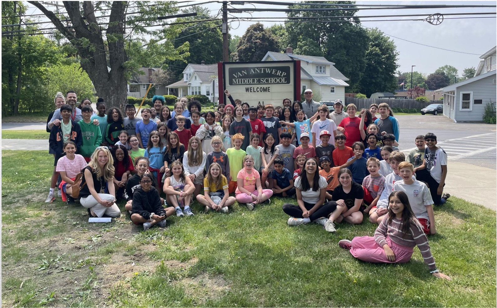
Craig Orientation May 23, 2023